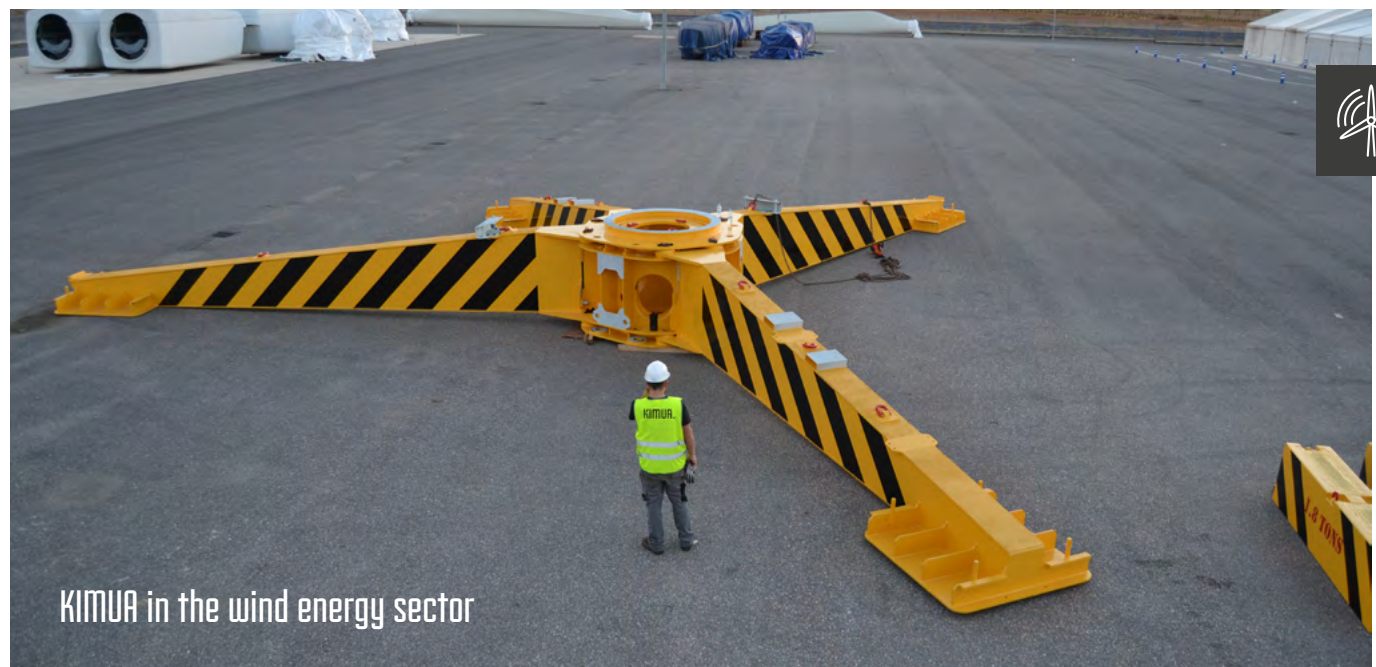
KIMUA in the wind energy sector