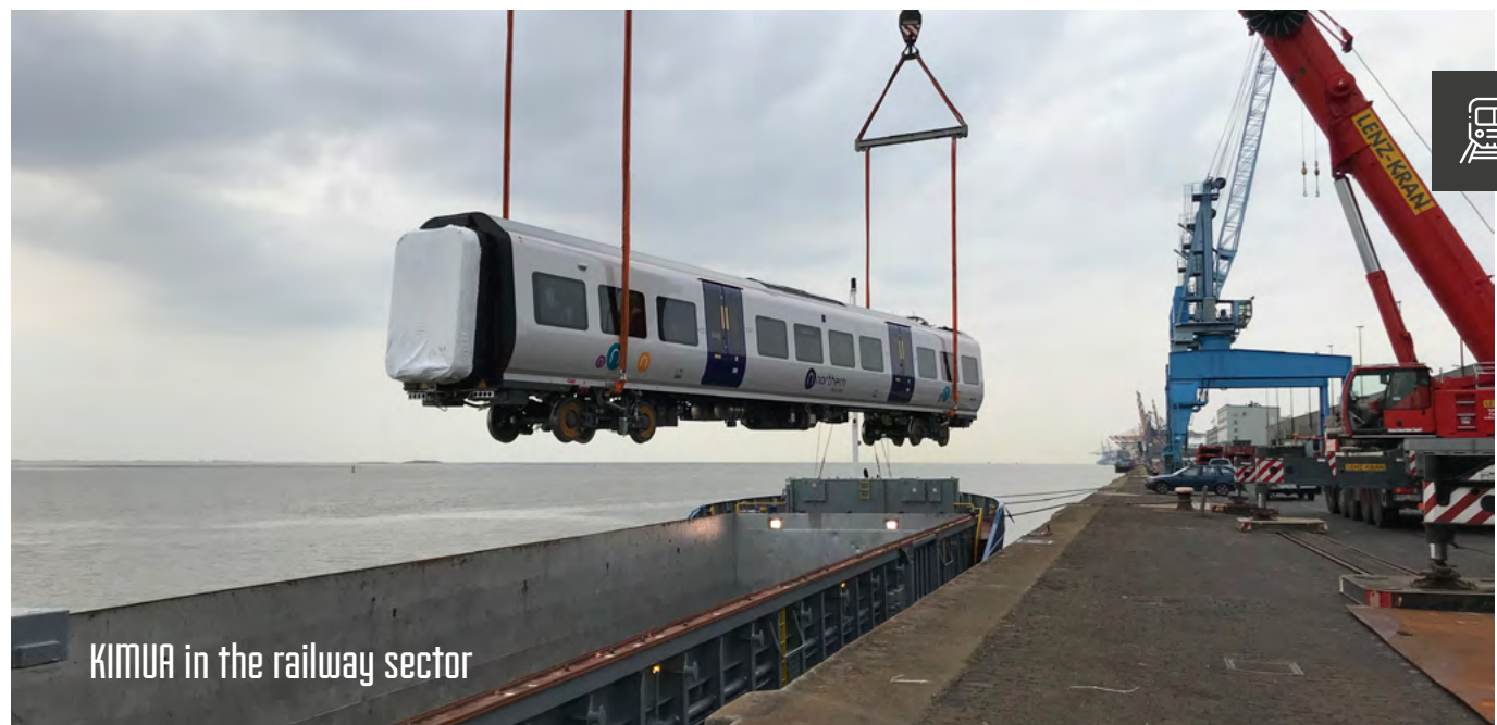
KIMUA in the railway sector